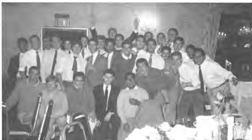
The brothers (and pledges) of the new chapters that were officially installed at the Awards Dinner: Gamma Nu (William Patterson State College), Gamma Xi (State University of Southern Connecticut), and Gamma Omicron (SUNY, Stony Brook).