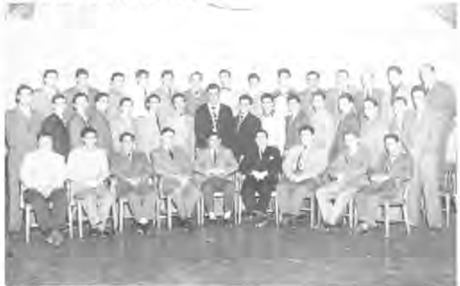
Charter members of Beta Iota - 1949