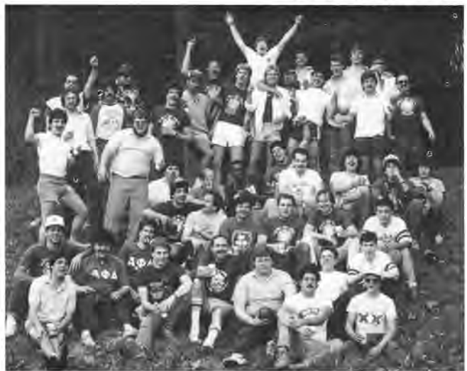
Chi's 1986 Swampwater Picnic