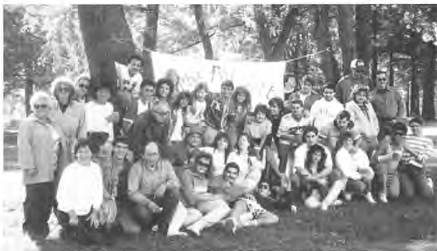
It's picnic time in the Third District. More than 55 Fraternity men and their wives, children and girl friends (many, but not all, of which you see here) had a fine time at the District's Annual Picnic held on September 27 at Wolf Pond Park in Staten Island, NY. It was a perfect day for football, volleyball and "facts in fives", in between the barbeques, beer and braggioli that was consumed. It was one of the best picnics in years.